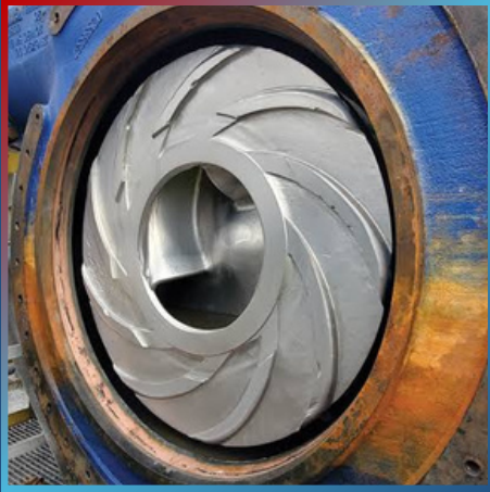
Impeller Inspection & Clearance Setting