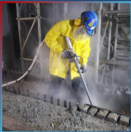
High Pressure Descaling & Cleaning