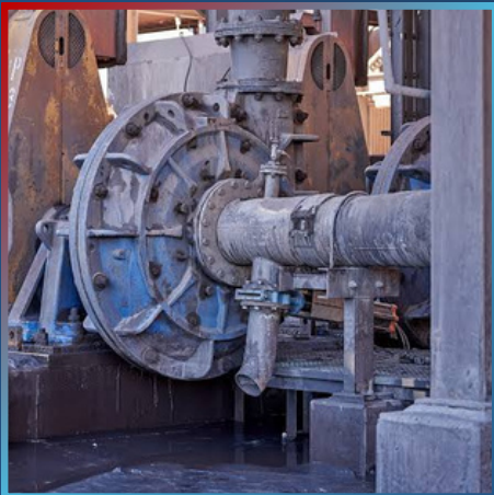
Centrifugal Pump Repair & Installation